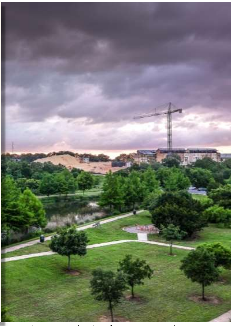
Sheraton Hotel and Conference Center under construction 19