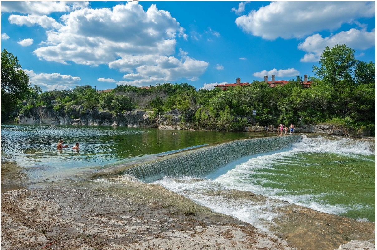
Summer Day in Blue Hole