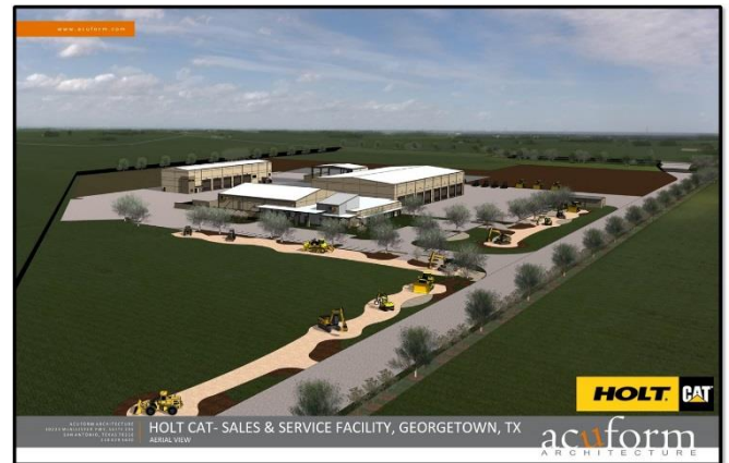
Rendering of the Holt Cat Sales Facility in Georgetown

Holt Cat Project: In FY2017 the Economic Development department and GEDCO helped facilitate Holt Cat's move to Georgetown. The Caterpillar retailer will open in FY2019.