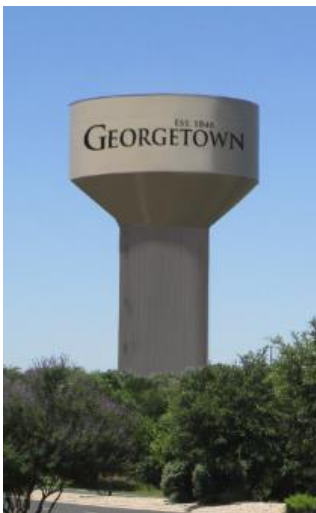
Elevated Storage Tank

Water Utility: Proposed enhancements to water utility operations include converting to automatic meter reading technology in the western district, and adding a water services crew to improve the response time to install and maintain meters. Capital projects funded by water utility revenue include the expansion of the South Lake Water Treatment Plant, the construction of the Braun Elevated Storage Tank, and the rehabilitation of several existing water storage tanks.