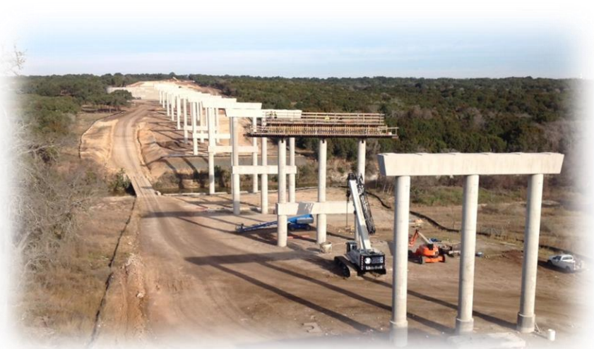
Construction of the Southwest Bypass

Southwest Bypass Construction: The signature project of the 2015 Road Bond Referendum is the Southwest Bypass, a new arterial that will connect State Highway 29 with Leander Road. Construction of the $20 million project began in FY2016 and is scheduled to be completed in FY2018. The bypass is designed to increase mobility to the west and south sides of the city. Another segment of the road will be built by Williamson County to connect Leander Road to I-35. This is the largest transportation project in the City's history, both in scope and cost.