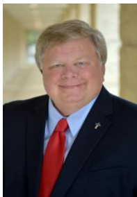
Mayor Dale Ross